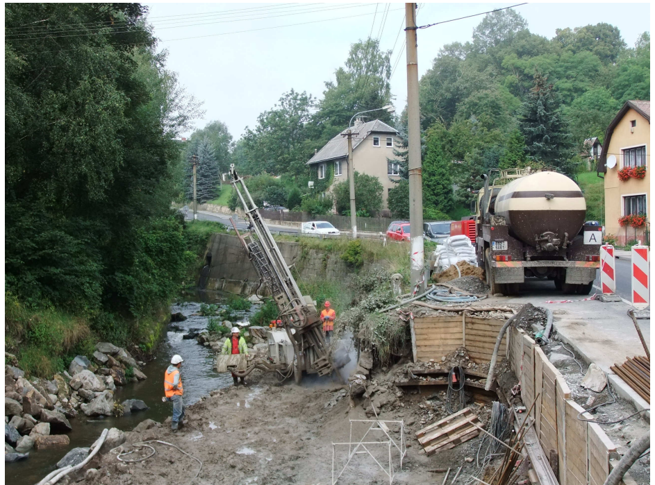
JG works in progress

DESCRIPTION: Cut-off wall by jet grouting in front of supporting wall against scour the foundations and filling space under foundations of supporting wall by jet grouting. Works on temporary embankment in a stream.