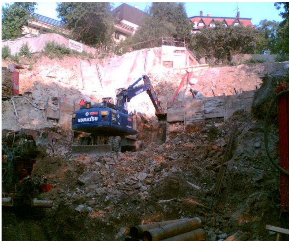
Excavation of the construction pit