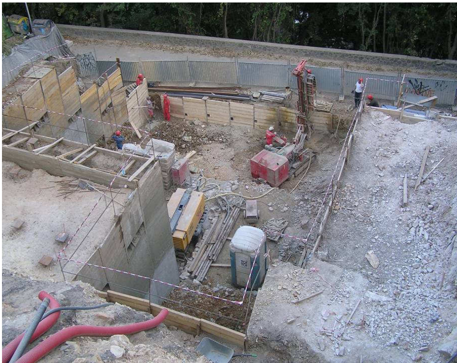
View of the construction pit