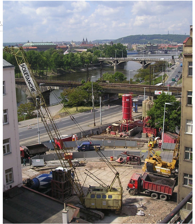
Site works – excavation of diaphragm wall