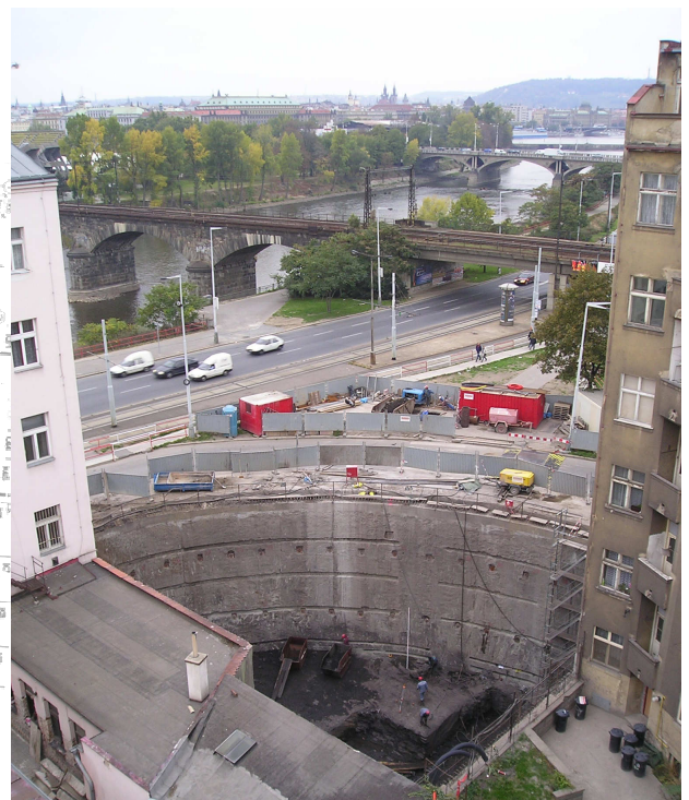
Anchored diaphragm walls