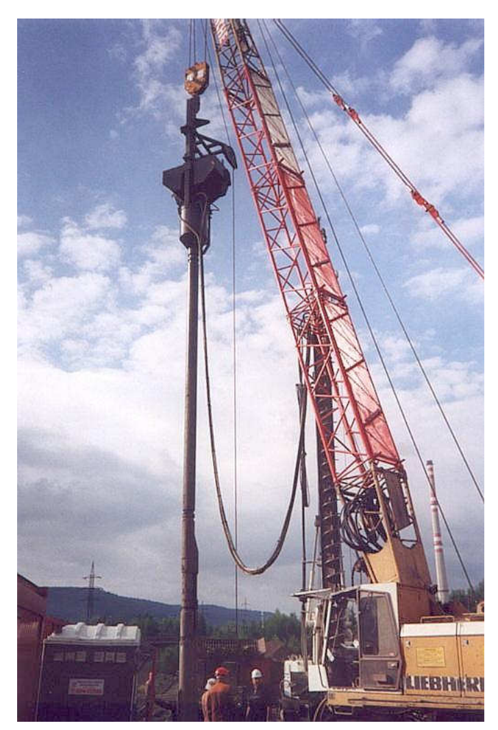
Stone columns installation

Part of D8 motorway has to be constructed across former opencast mine recovered up by very compressible clayey fill which thickness is up to 35 m. As a soil improvement 16 stone columns was installed and loading tests for short and long time was performed in order to prove the efficiency of this solution. As the soil was rather stiff the predrilling was applied. All settlements and other parameters