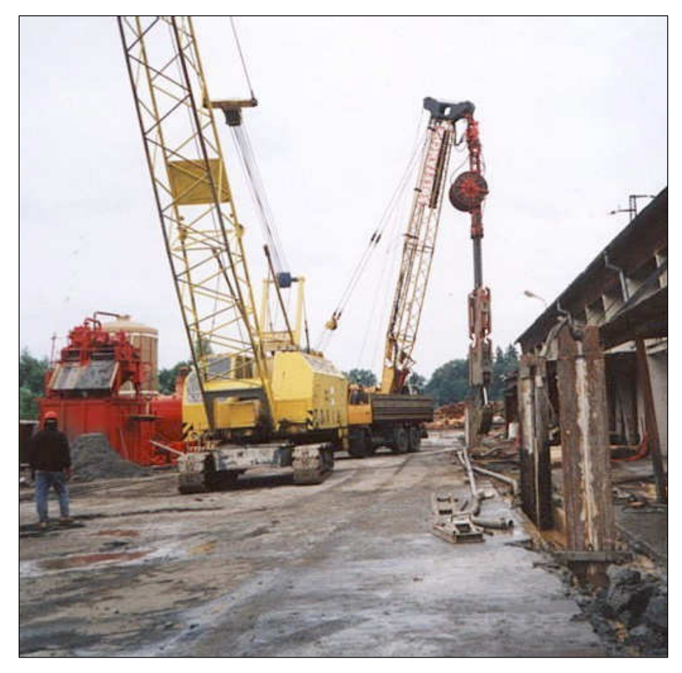
Realisation of cut-off walls