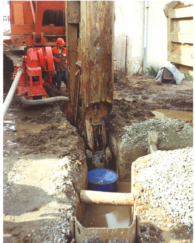
Working on drain wall

DESCRIPTION: Drain wall with pumping wells and jet-grouting barrier for polluted ground water flow rectification. Use of biodegradable slurry. Works in congested factory area.