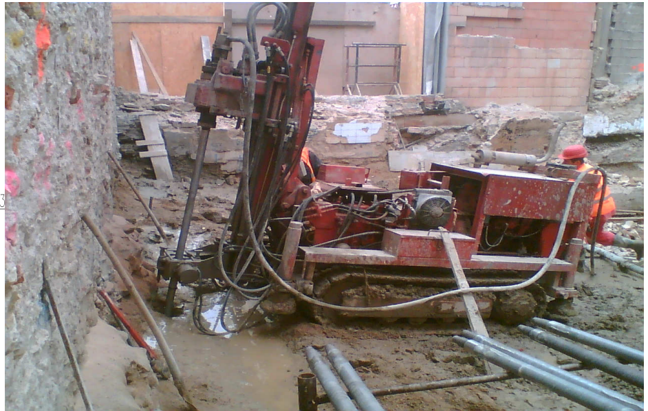
JG works in courtyard

DESCRIPTION: Jet-grouted retaining walls and underpinning of existing buildings – use of drilling mini-rig.