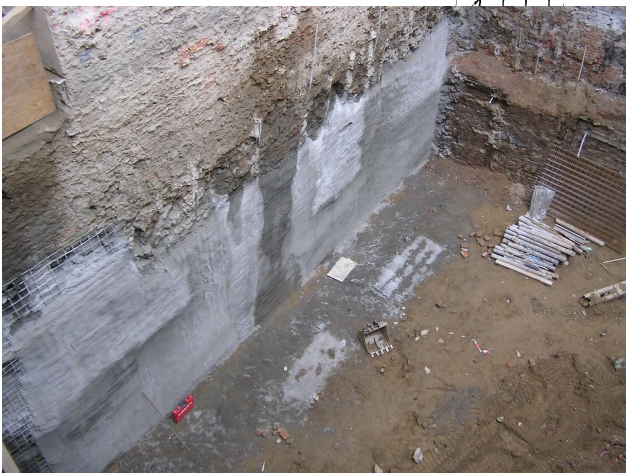
View of retaining wall