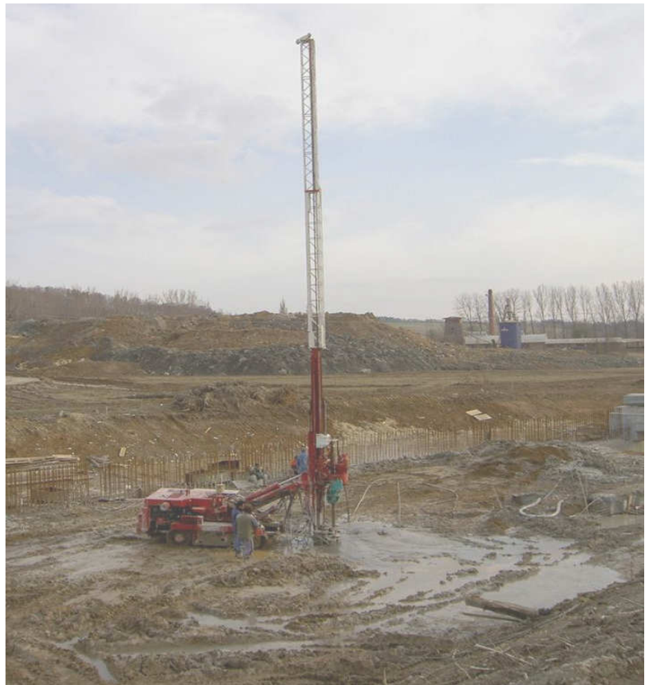
Creating the bottom slab

Single jet grouting method for creating 3m thick bottom slab between secant pile walls (and diaphragm walls) for cut-and-cover tunnel and for improving soil characteristics in tunnel entries. The special lime-cement grout (called HAMASOL) was used because of presence of highly expandable organic peaty clays. JG columns in triangular 0,75m grid – in total 3750m of JG and 11300m of empty drilling. Diameter of columns varied between 800 and 1200mm.