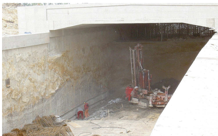
Vertical drains drilling