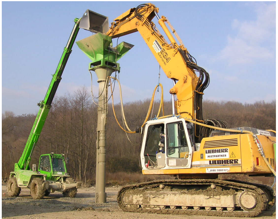
Stone columns installation

DESCRIPTION: Part of D8 motorway embankments are constructed across compressible clayey soil – tuffitic clays. As a soil improvement 1 752 stone columns was installed up to 4 and 6 m depth.