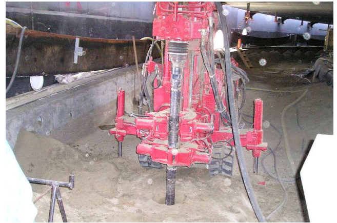
Drilling for micro-piles

Mini piles for soil improvement under two existing large oil tanks. Drilling inside of tanks.