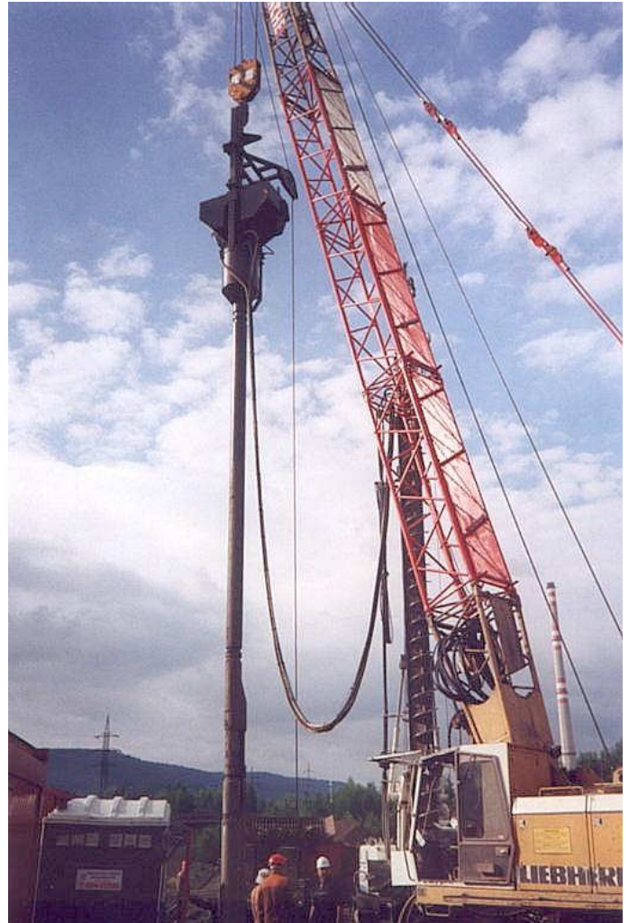
Stone columns installation