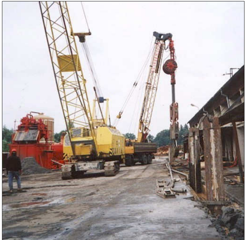
Realisation of cut-off walls

The soil in a part of JDZ Soběslav company area was contaminated by PAH. The remediation works, i.e. replacement of contaminated soil by an inert one, were realized outside of the existing buildings. Therefore, these earthworks were accompanied by the system of diaphragm walls with two purposes: